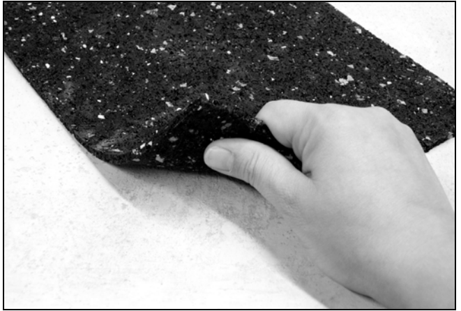
QT provides exceptional performance under hard surface flooring and over concrete and wood joist construction.